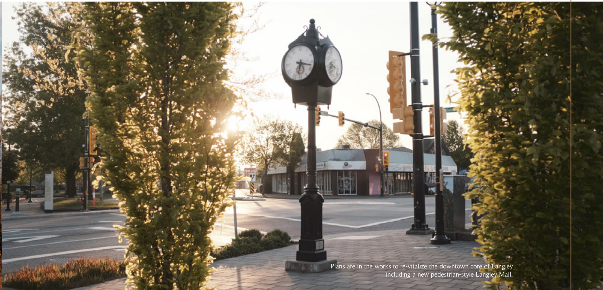
Plans are in the works to re-vitalize the downtown core of Langley including a new pedestrian-style Langley Mall.